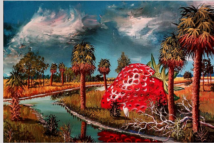
"Love Is In The Air" 16" X 24"