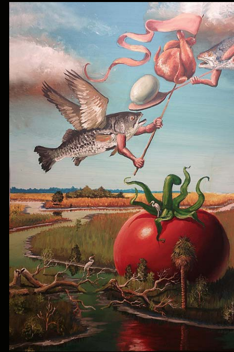
"Crab with Seegar" 48" x 32"