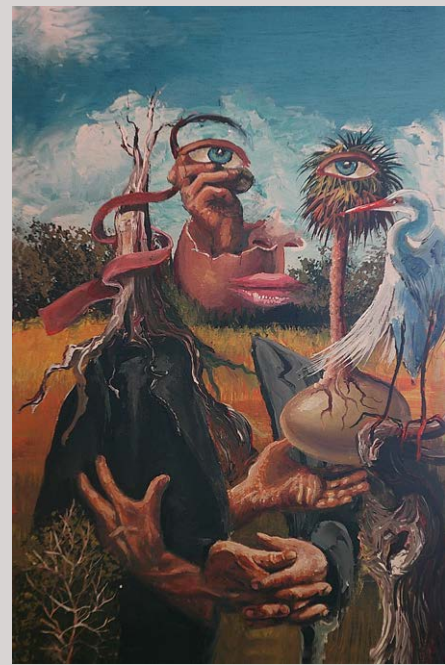
"Lowcountry Lament" 24" x 16"

"I don't think I ever came down from that last hit of LSD"