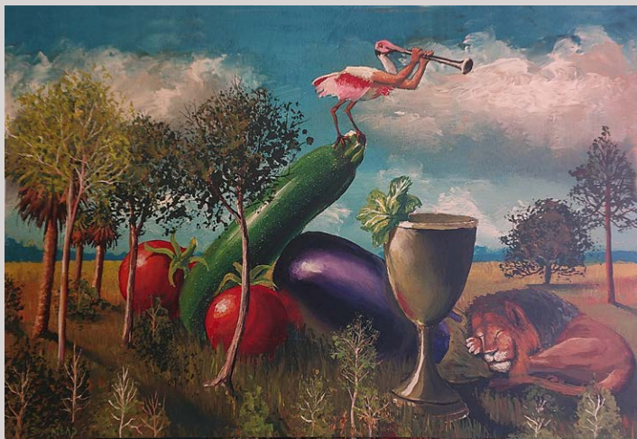
"Don't Toot Your Own Horn" 16" X 24"

"Choose your illusions carefully, for you're going to have to live with them"