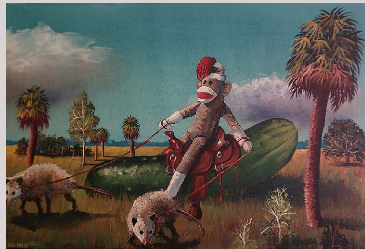
"Rein on the Plain" 16" X 24"