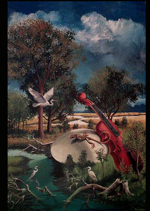
"Lyrical Lizard" 48" x 32"