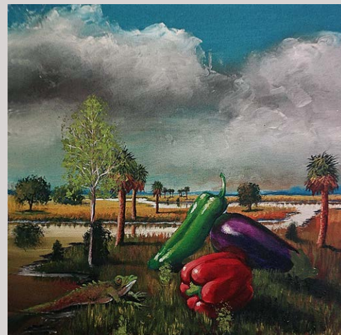
"Your Reach Should Exceed Your Grasp" 18" x 18"

"Choose your illusions carefully, for you're going to have to live with them"