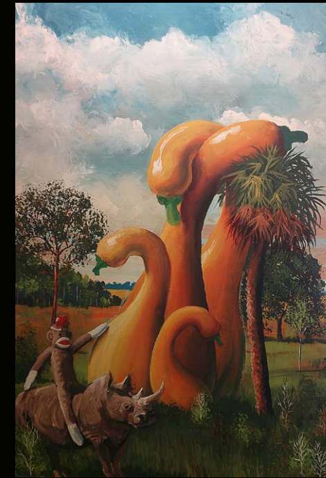
"The Nuclear Family" 48" x 32"