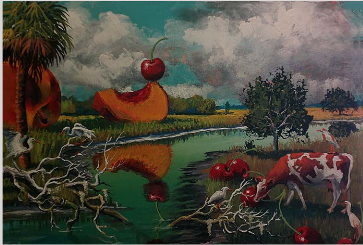
"Neck and Neck" 16" X 24"