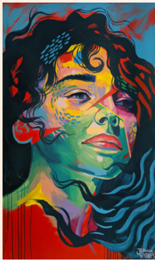
Surrender To Tides Archival print 25x15" (30x20" with frame)