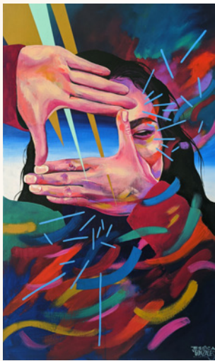
One Way Window Archival print 25x15" (30x20" with frame)