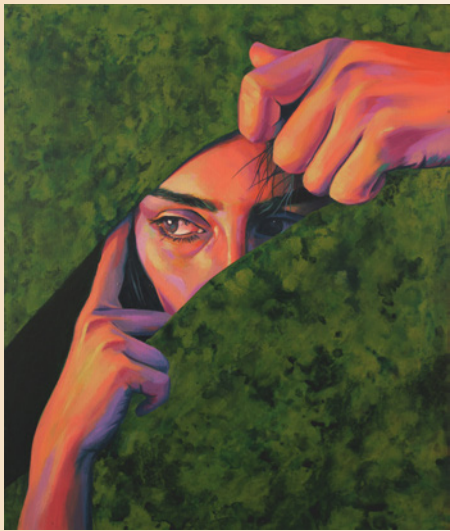
The Parts I Choose – Pt. 1 Acrylic and rubbing alcohol on canvas 24x20"