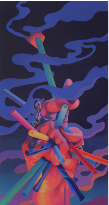
When It Ends, Let It End Acrylic on canvas 48x24"