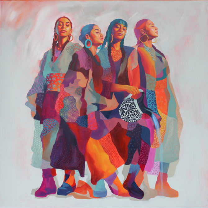
The Fabric Remembers What I Do Not Acrylic on canvas 48x48"