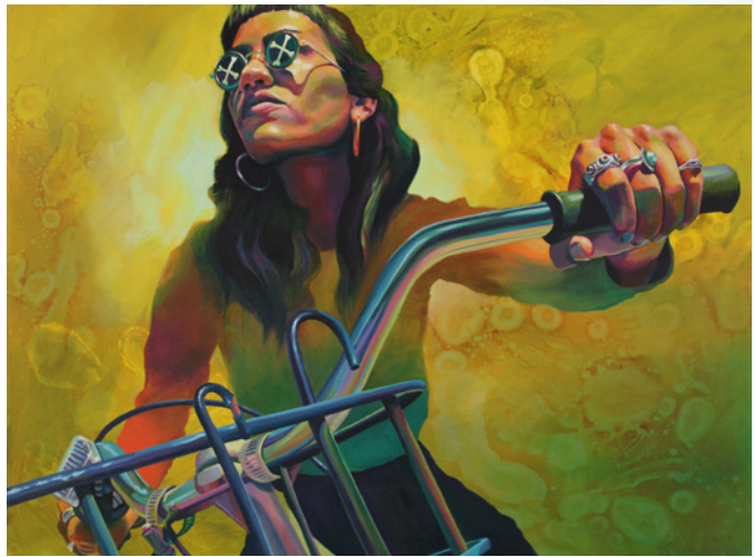
Before It Faded, It Was Real Acrylic and rubbing alcohol on canvas 36x48"