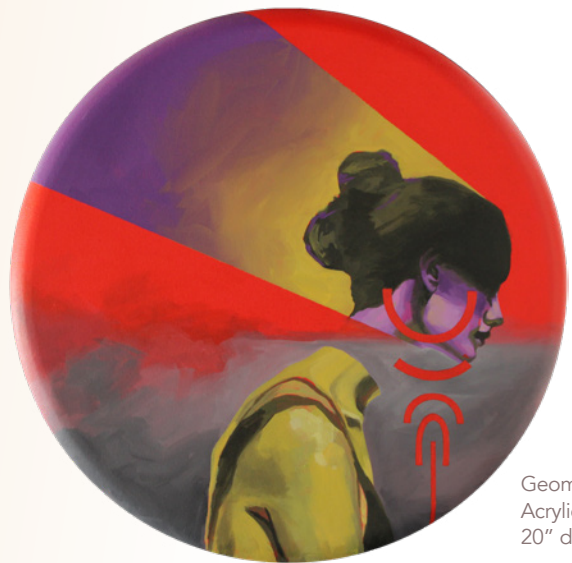
Geometry of Absence Acrylic on canvas 20" diameter