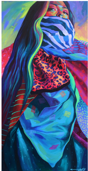
The Silent Armor Acrylic on canvas 48x24"