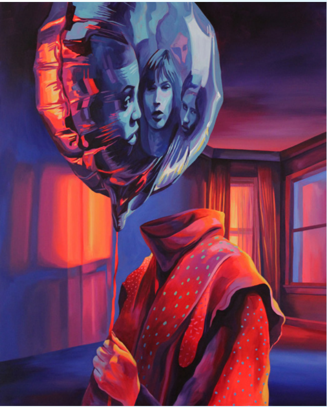
She Could Just Let Go Acrylic on canvas 60x48"