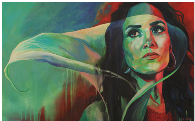
The Bloom That Split The Sky Acrylic on canvas 30x48"