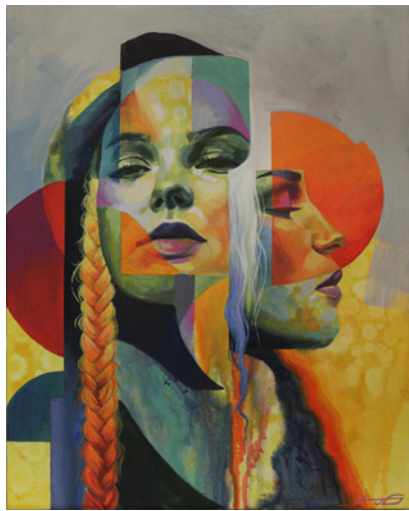
Flux Acrylic and rubbing alcohol on canvas 20x16"