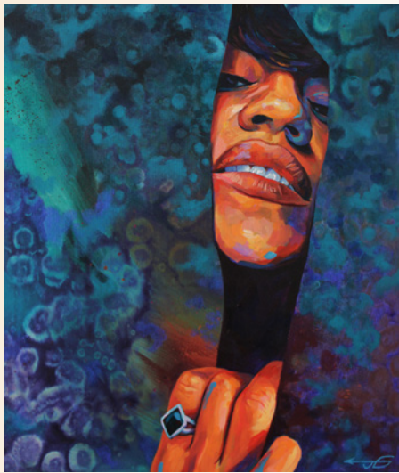
The Parts I Choose – Pt. 2 Acrylic and rubbing alcohol on canvas 24x20"