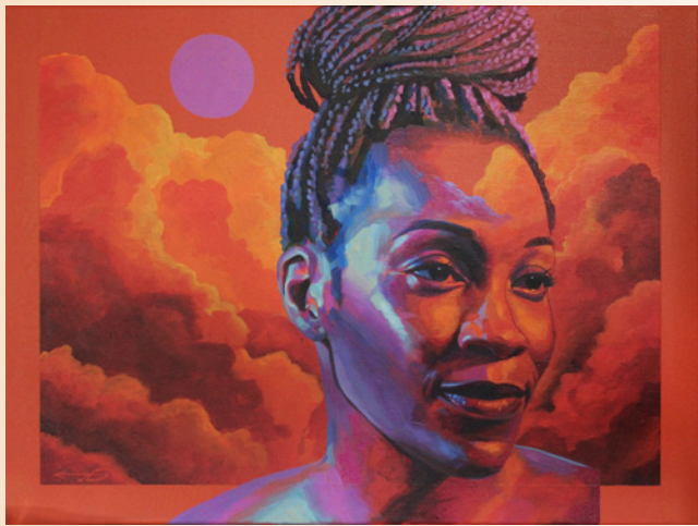
Even The Sunset Has Quiet Days Acrylic on canvas 18x24"