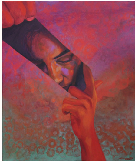
The Parts I Choose – Pt. 3 Acrylic and rubbing alcohol on canvas 24x20"